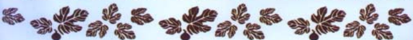
FIGUIER ref. 12