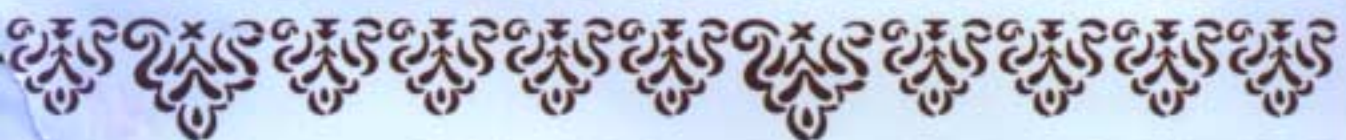
LAMBREQUIN ref. 03